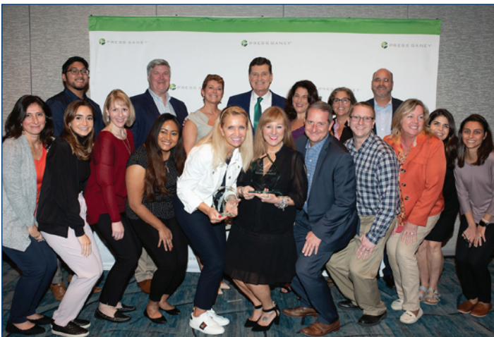
The awards were presented to Greenwich Hospital staff at the Press Ganey National Client Conference. Press Ganey is the nation’s leader in measuring the patient experience.