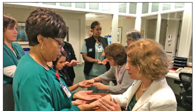
Nurses on the Surgical unit gathered for the Blessing of the Hands, a tradition practiced by hospitals around the world.